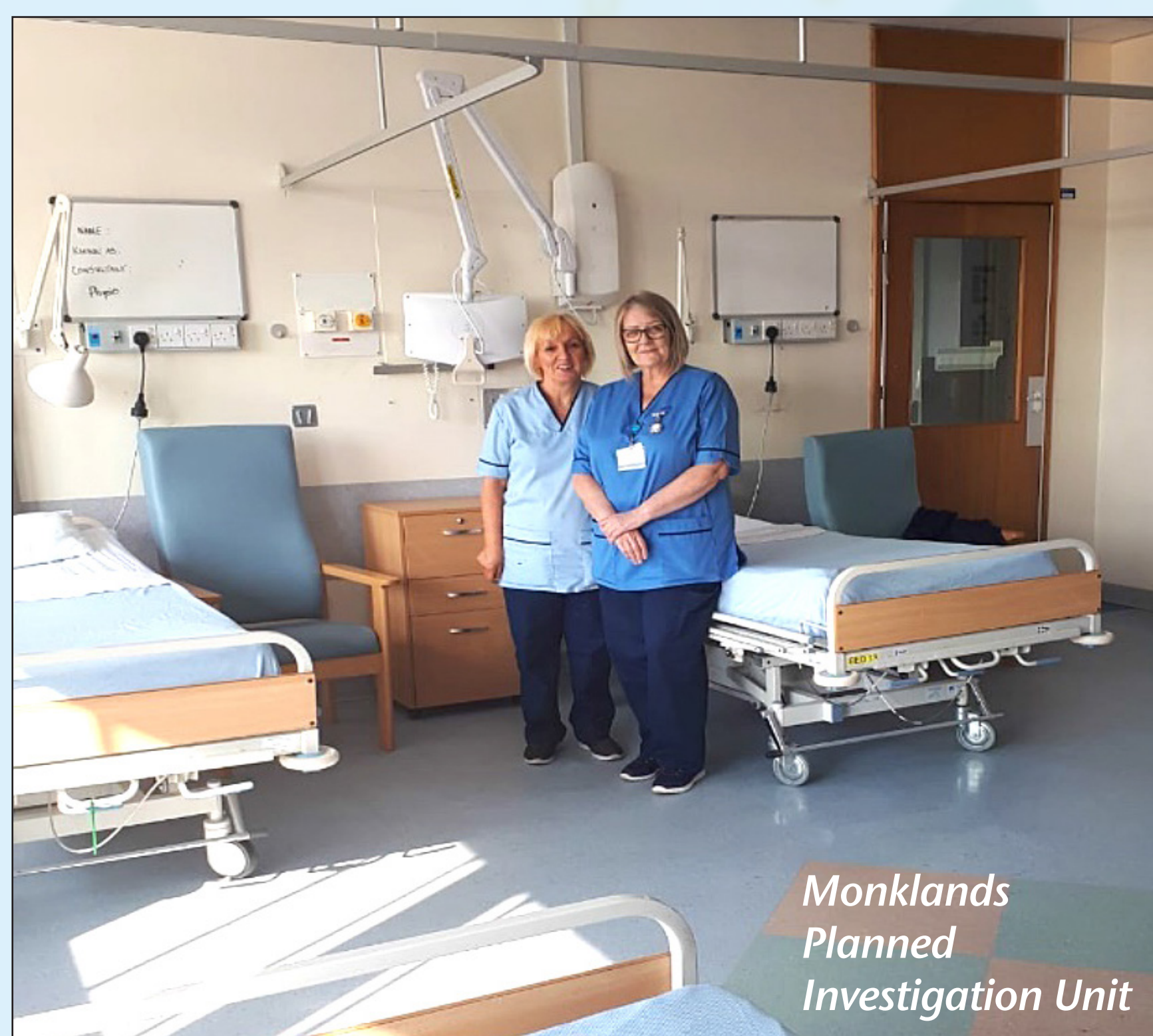
Monklands Planned Investigation Unit