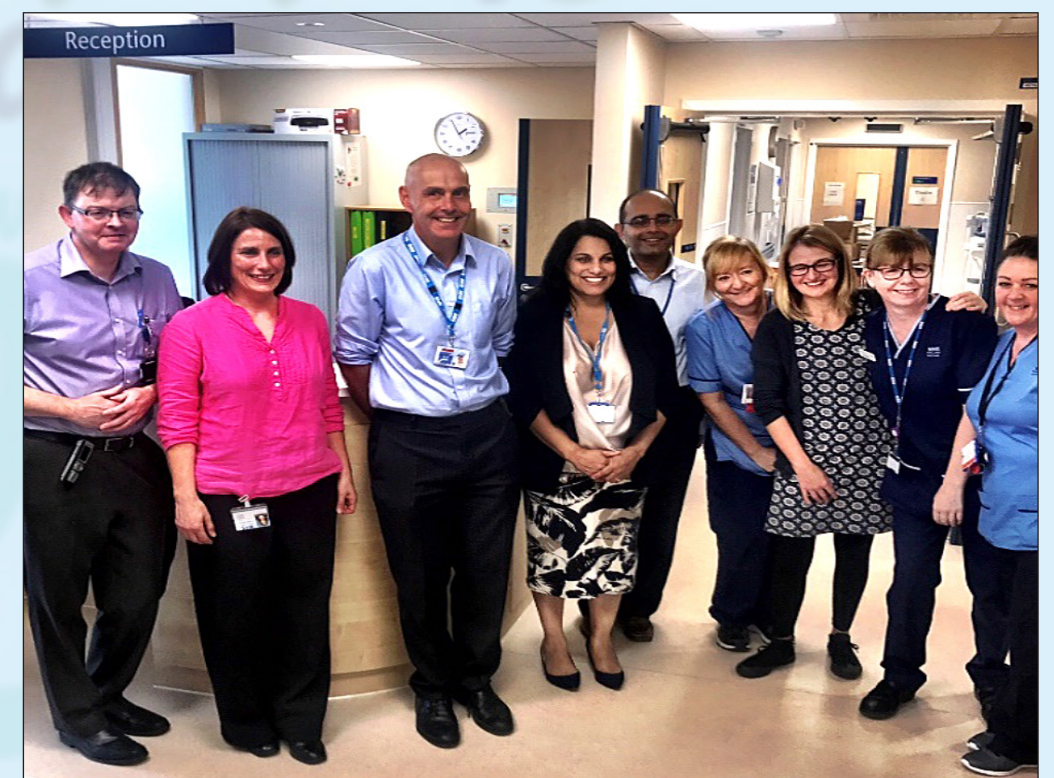
PIU – Original Home – A converted 4-bedded room – October 2016. PIU – Bespoke Facility – Opened by the NHSL Chief Executive and Chair – October 2017

to achieve required competencies and a programme of training and upskilling is ongoing.