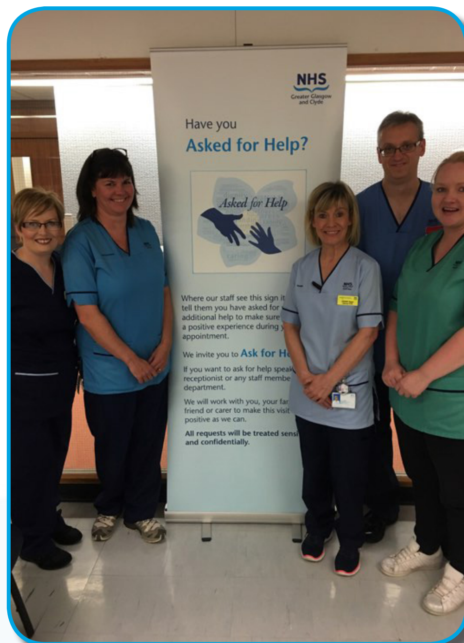
Launch day at GRI