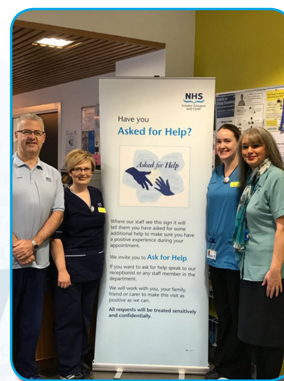
Launch day at Stobhill

We developed a process that will allow staff to know a person has asked for help. This involves using an ink stamp with the "Asked for Help" symbol be placed on our internal paperwork that follows a person through the department during their appointment. Identify a pilot site and agree a timeline for roll out.