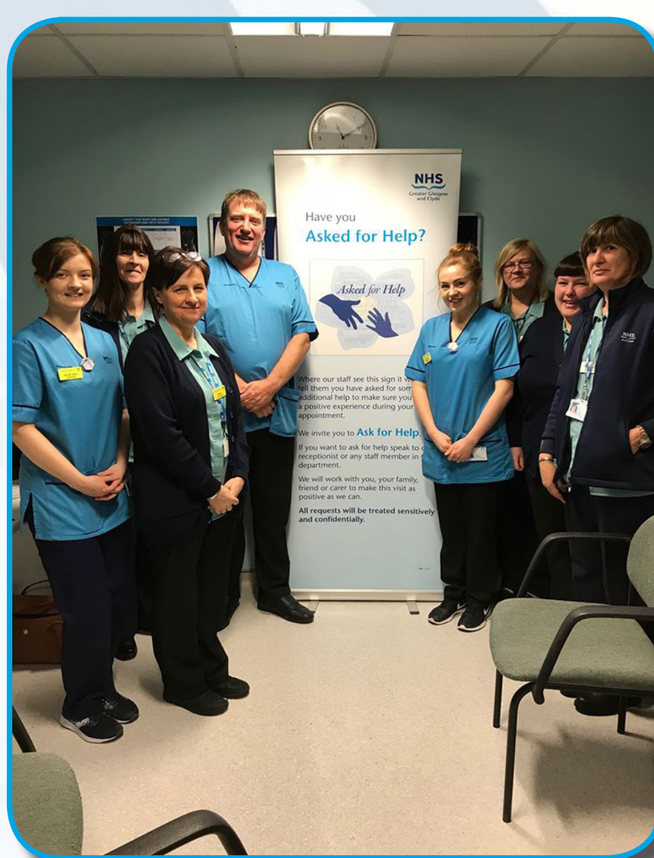
Launch day IRH

Audit findings, refine and adjustment as required and report back to staff and management.