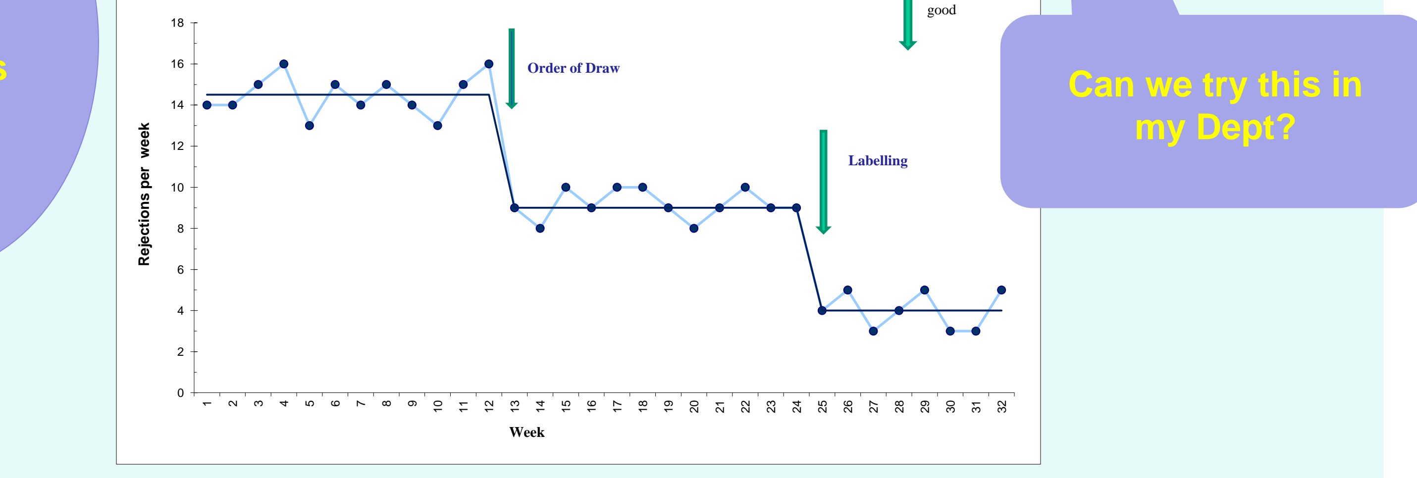
Fig two: run chart showing iterative improvements in request rejections.

These concepts harmonize with Realistic Medicine in addressing